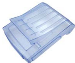
Spill proof cover