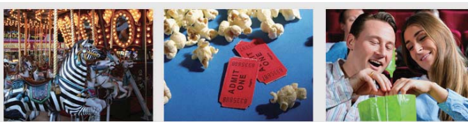
AMUSEMENT PARK TICKET